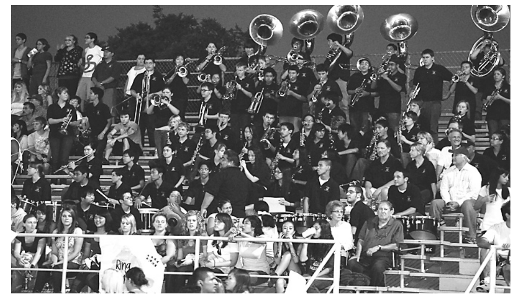
Band Playing at th Bell Game for Support.

and 0 period every morning. They also had the band members attend a 2 week band cap prior to school in 1st in the class B division and continues to thrive order to better prepare the regiment. In these practices the band members take part in various exercises to reach near perfection. They practice marching