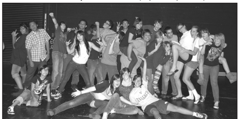
ALL THE STUDENTS WHO ATTENDED LAST FRIDAYS WORKSHOP.

games of improve with names like week of October 5th for those interested Huggy Bear, Aah, Freeze, New Choice, in testing their improv skills. Auditions and more. The game that caught many will be held in room 507 before school, of the students' attention was "What break, and after school. The show will Are You Doing?". This game consists be held in the auditorium next Friday of two participants their wacky ideas. October 9th at 7:00 pm. A professional Each person takes turns acting out Referee will attend to judge both teams.