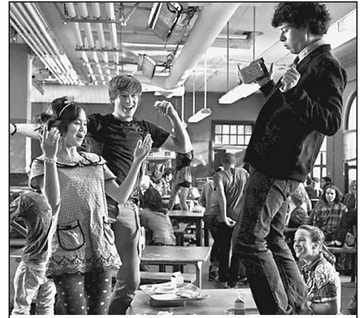
A SNEAK PEAK OF THE NEW MOVIE.

grounds of both these people and their different thought. When it came to background, the movie showed many types, from poor and rich, to self sufficient and broken families. There is also a story of a boy whose unfortunate family and personal circumstances hindered him from reaching his potential which he soon broke out of and a young pianist who wanted to branch out in her talents but was hindered by her parents. I general, the movie is slow to start but ties in each different story well. The ending concludes each person's story as well as the collec-